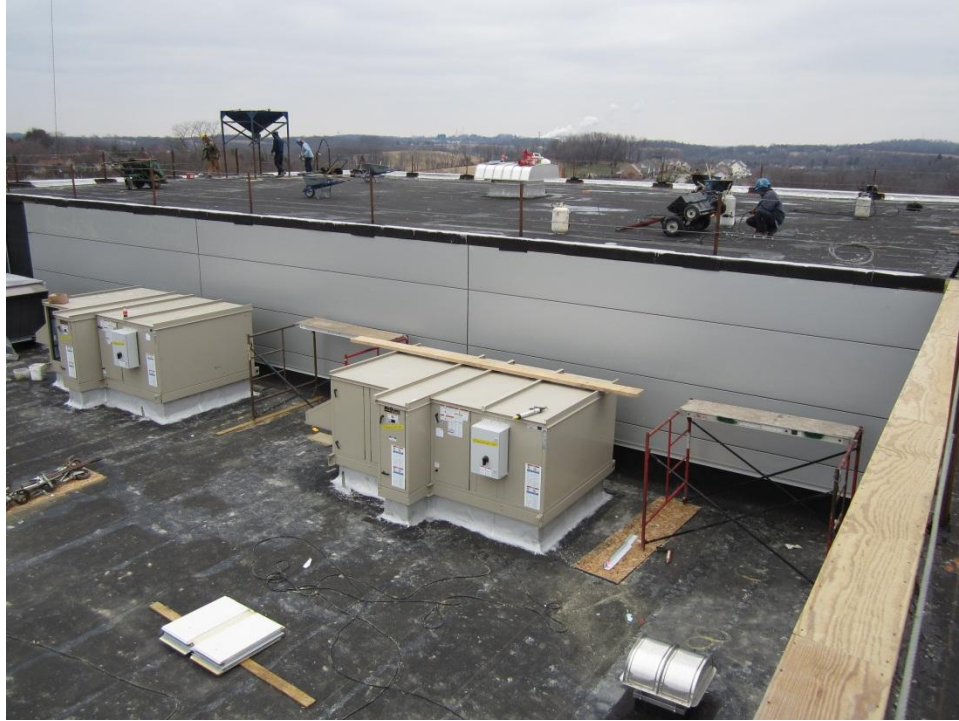
Siding low roof c