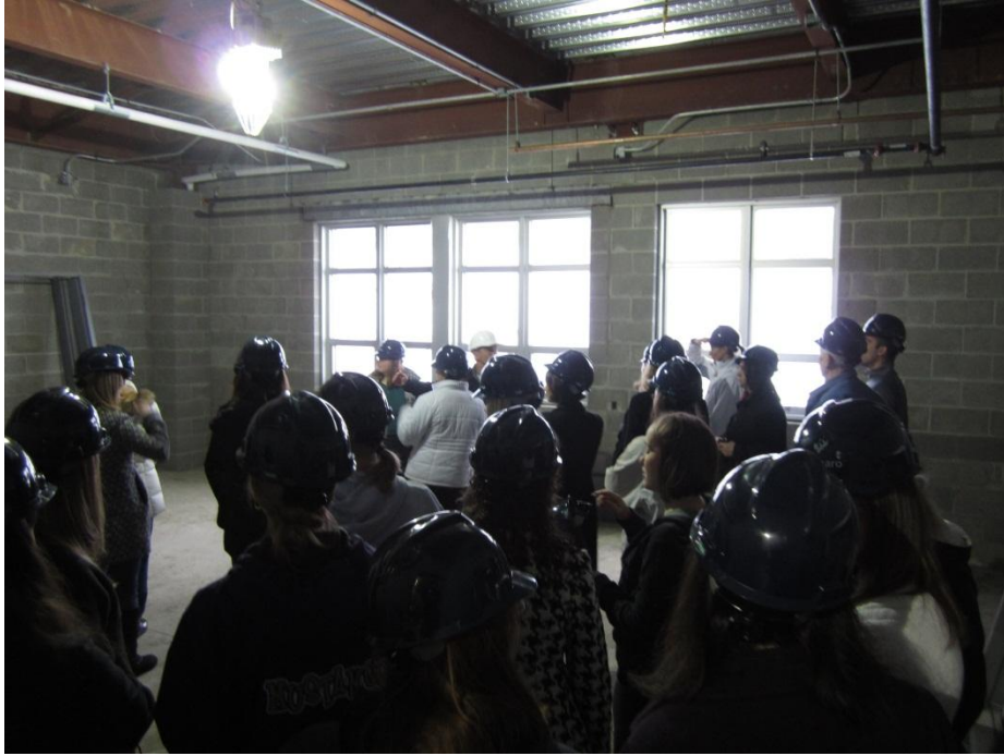
Pivik teacher walkthrough