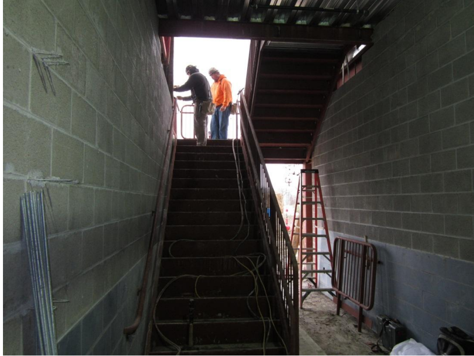
Stairwell area d