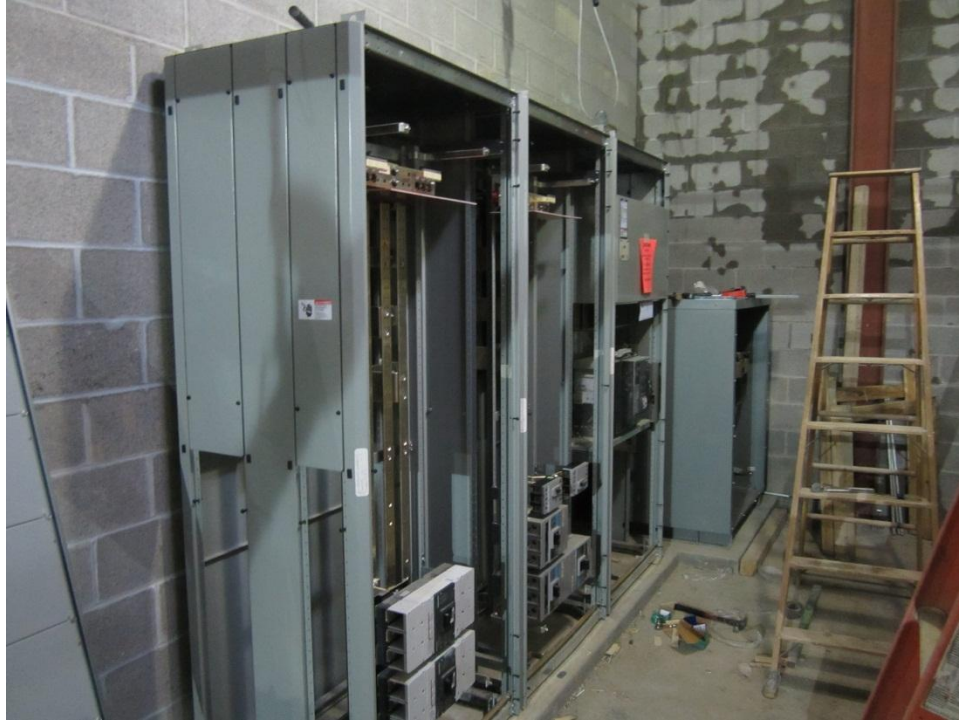
Electrical equipment room